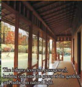
The hirikawa (covered passageway), looking out onto the green of the garden, and bathed in natural light.