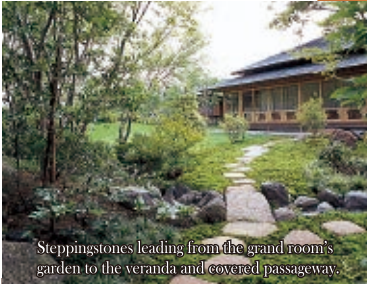
Steppingstones leading from the grand room's garden to the veranda and covered passageway.