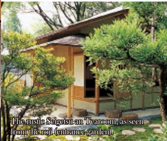
The rustic Seigetsu-an Tearoom, as seen from the roji (entrance garden).

The roji (entrance garden) as glimpsed through the open guest entrances. The nijiri-guchi on the left is entered by crawling, while the kinin-guchi on the right is entered standing up.