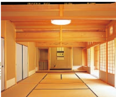
The hiroma (grand room) as seen from the yorituki (antechamber), showcasing the spacious connecting rooms.

Unkai is a tearoom built in the sukuiya style, rich with the traditional beauty of Japanese architecture and fragrant with the relaxing scent of wood. From tea ceremonies and flower arranging to Japanese poetry, this space is used to pass on Japanese culture to modern generations.