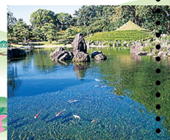
The graceful slope of miniature Mount Fuji is reflected in the pond.