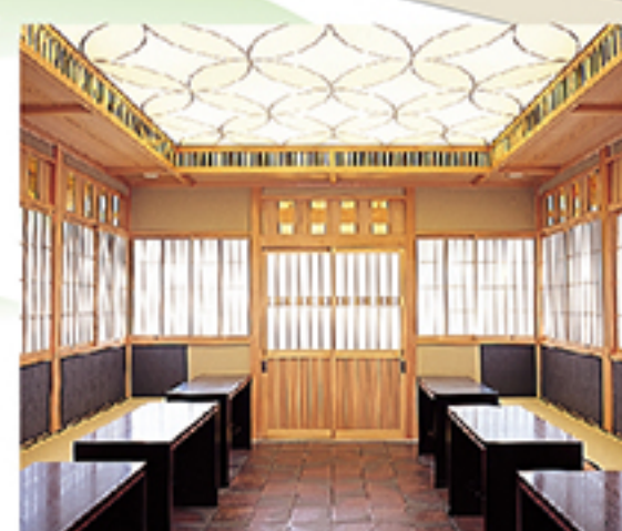
A casual tearoom with tables and chairs: Enjoy tea and sweets here during your stroll (fee applies). A modern twist to a traditional format.