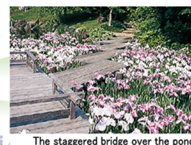
The staggered bridge over the pond.