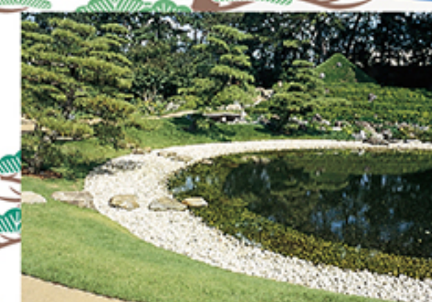
A sandy beach modeled after Miho no Matsubara.