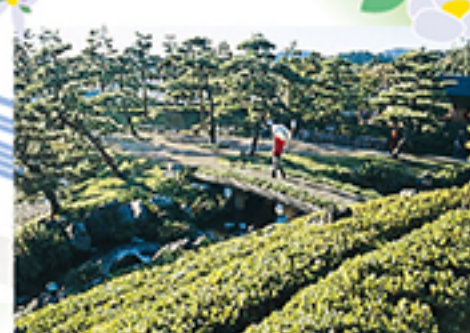
Miniature Mount Fuji