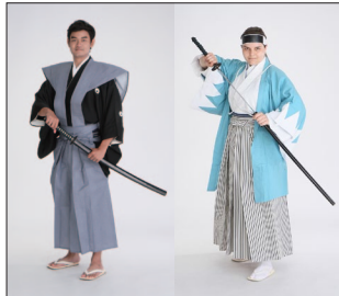
②Samurai : 3,000 yen