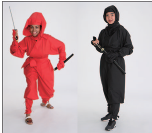
①Ninja : 2,000 yen