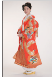
④Colorful wedding kimono : 5,000 yen

※With additional charge of 1,000 yen, you can have your picture taken by a professional photographer.