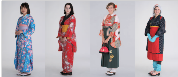
③Kimono : 3,000 yen